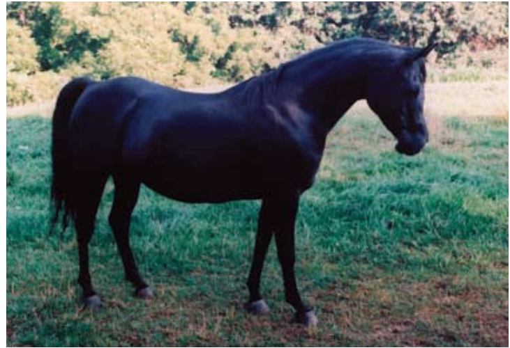
Sunnyru Maaroufa, our foundation mare in foal for 2008, produces quality SBEs, including her '06 colt BLMaaroufas Ibn Image.