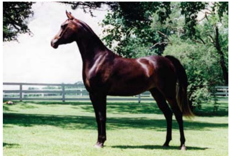
SR Bint Faaris, dam of Hunter Pleasure Amateur and Open Champion SR Manial Faaris, exemplifies the grace and beauty of the Sunnyrhu Straight Babson Egyptian.