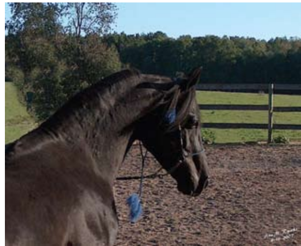
His distinctive pedigree represents a unique blend of older and newer Straight Egyptian bloodlines. Quality progeny for purchase. Shipped semen available.